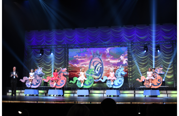
International Pageant Top 5 Tots in Tot Personality

their name, age and hometown. The Emcee will then ask her a few questions relating to the information provided on her Entry Form. This interview is designed to be brief but light-hearted and focuses on the communicative skills of the participant.